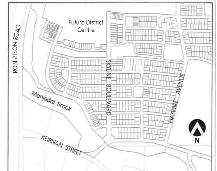
LOCATION AREA ■ SUBJECT LOTS