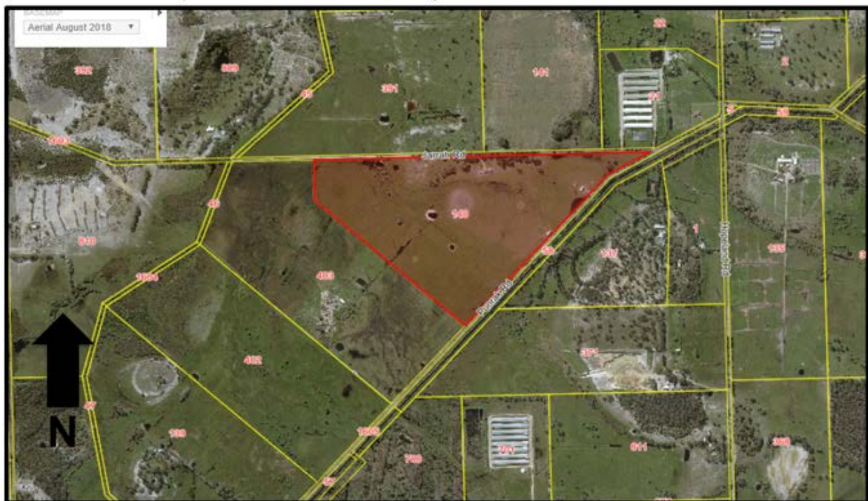
Figure 1: Aerial Photograph

The site is generally cleared, containing a strip of remnant vegetation concentrated on the northern boundary of the property along Jarrah Road. A power line corridor runs in a north to south direction to the west of the property. The general locality comprises of rural properties used for a variety of rural uses that include grazing, equestrian activities, poultry farms, market gardens, extractive industries, cattle studs and rural lifestyle lots.