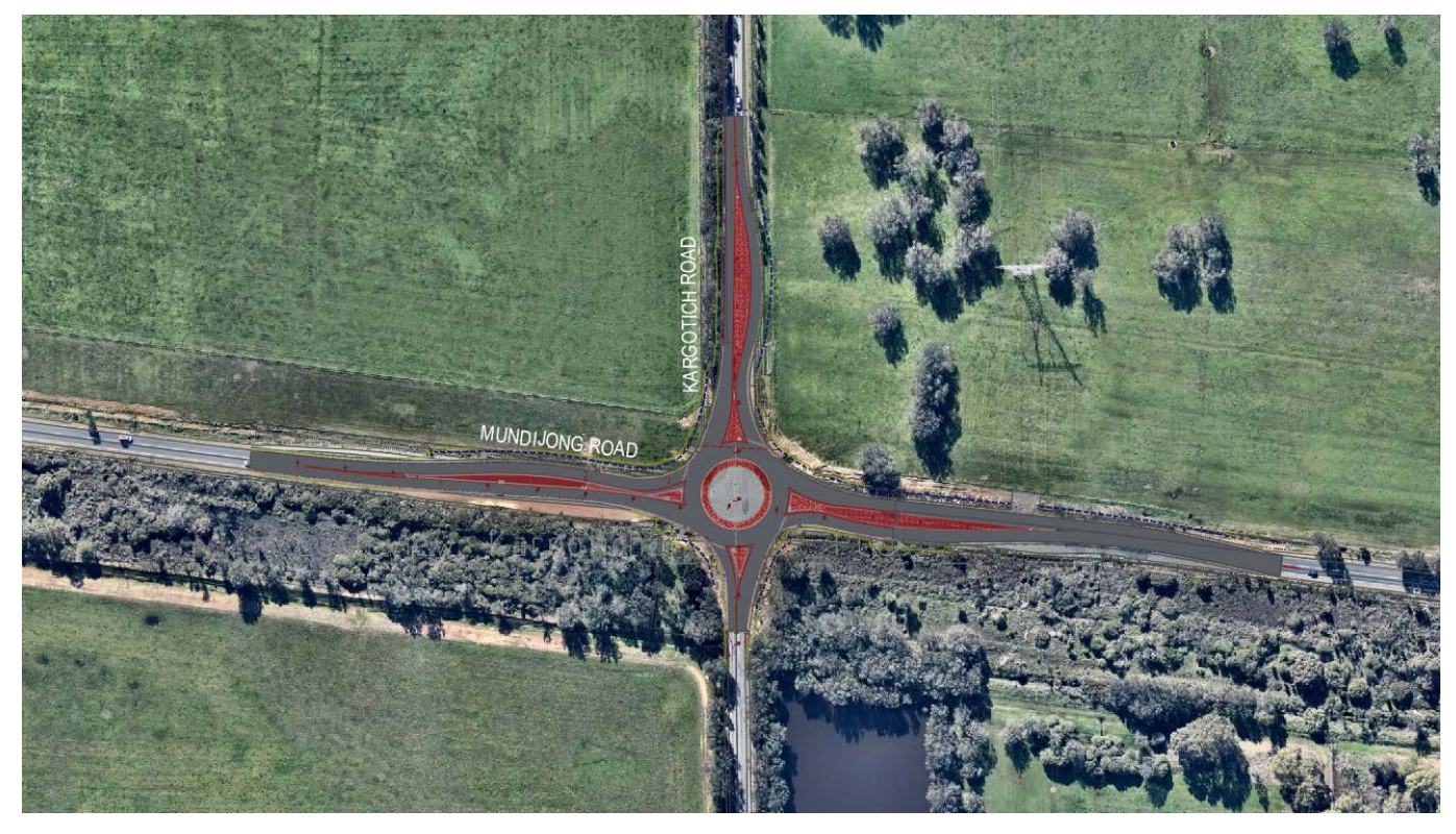
Figure 1: Proposed Mundijong Road/Kargotich Road Roundabout

During 2019/20 financial year, all works including land acquisition, utility services relocation (Telstra and Western Power), new street lighting, fence relocation and vegetation clearing works are completed to assist the civil construction works.