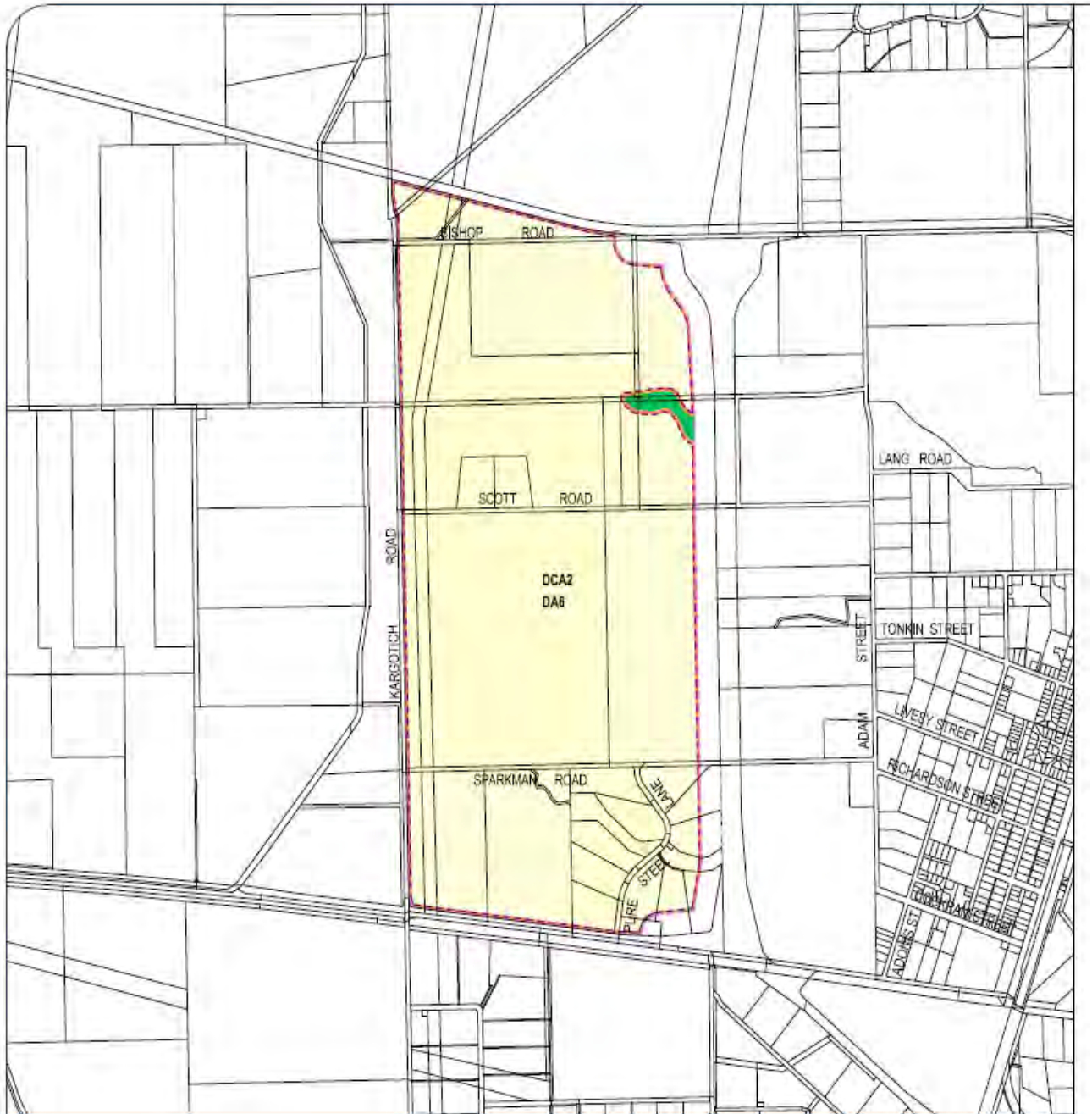
Figure 2 – West Mundijong Industrial Development Contribution Area