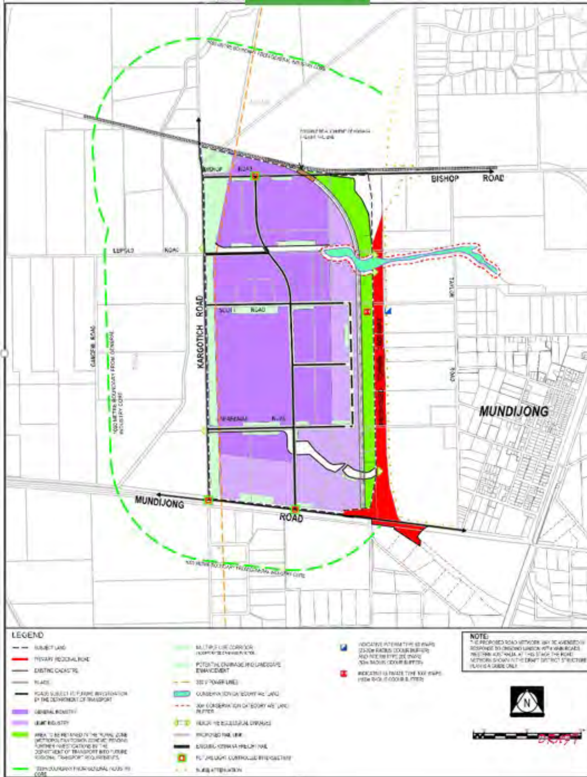
Figure 1 Original Council Approved West Mundijong District Structure Plan Map