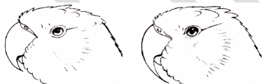
Comparison of the heads of a Carnaby's cockatoo (left) and a Baudin's cockatoo (right), showing the longer and finer upper bill in Baudin's cockatoo.

There are three species of black cockatoo native to south-west Australia, two species of white-tailed black cockatoo and one species of red-tailed black cockatoo. The white-tailed black cockatoo with the short bill is Carnaby's cockatoo ( Calyptorhynchus latirostris ) and the white-tailed black cockatoo with the long bill is Baudin's cockatoo ( Calyptorhynchus baudinii ). The forest red-tailed black cockatoo ( Calyptorhynchus banksii naso ) is the only red-tailed species in the forests of the south-west of WA.