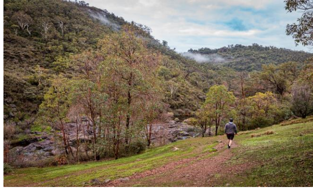
Step outside and disconnect