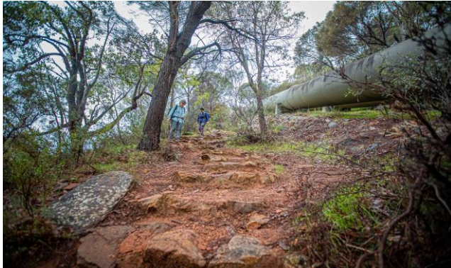
Step outside and take another step forward