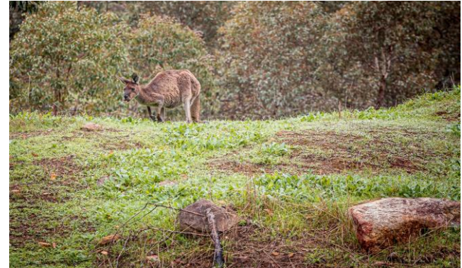
Step outside and meet one of the locals