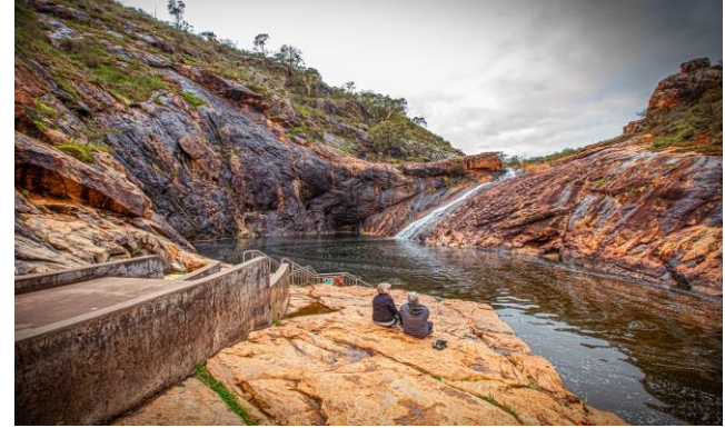
Step outside and share a story