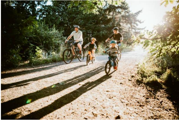
Step outside and watch them grow