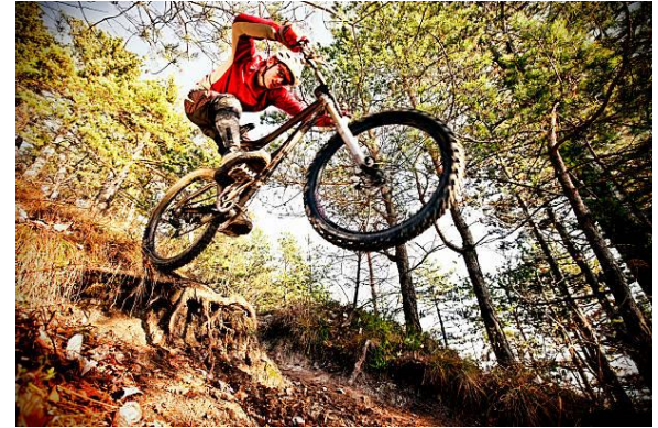
Step outside and take it to the next level