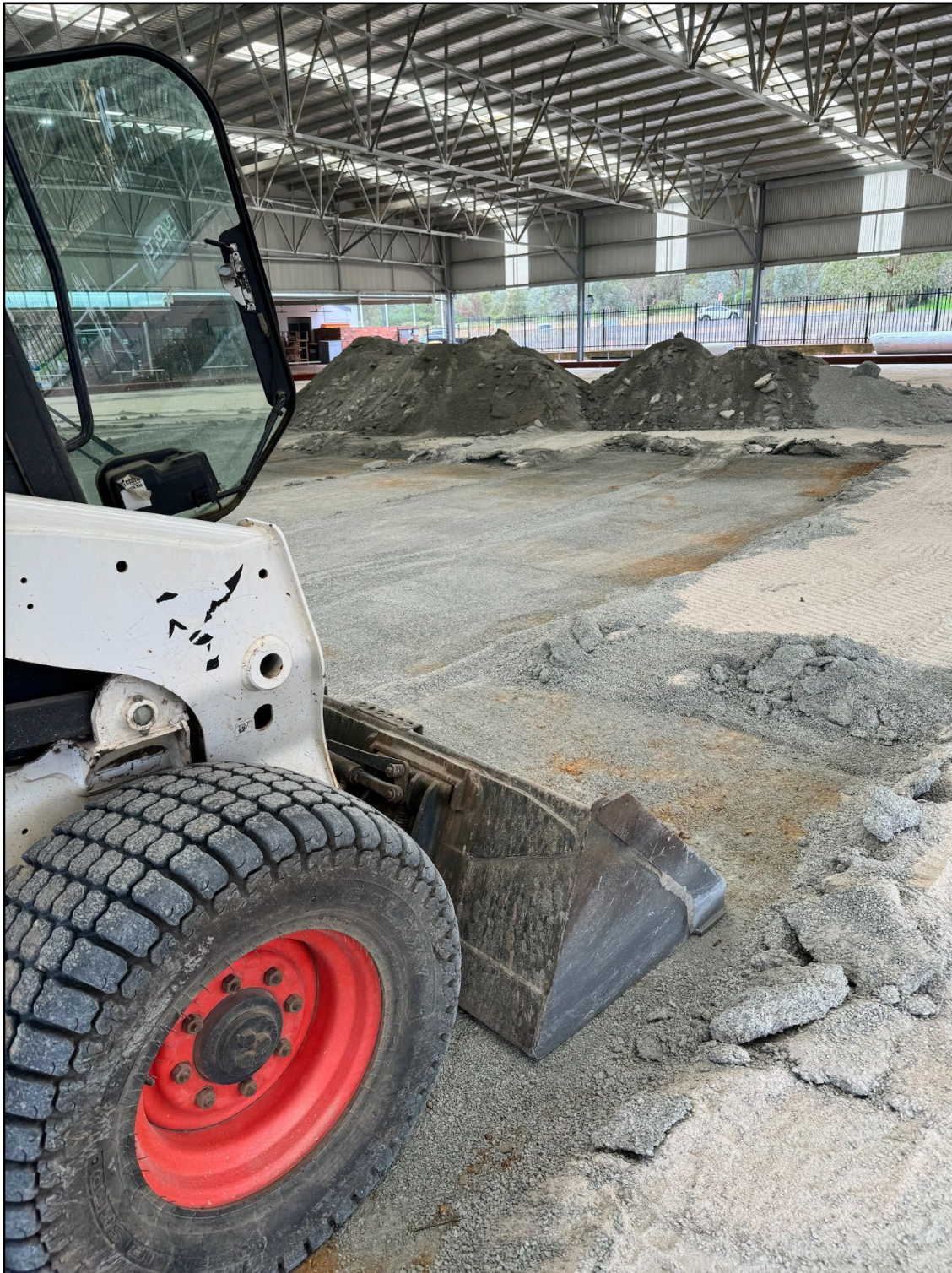
Image 3: This depicts the removal of the crumbling base. It should have been a bonded mixture of blue metal and concrete to provide a solid, level playing surface.