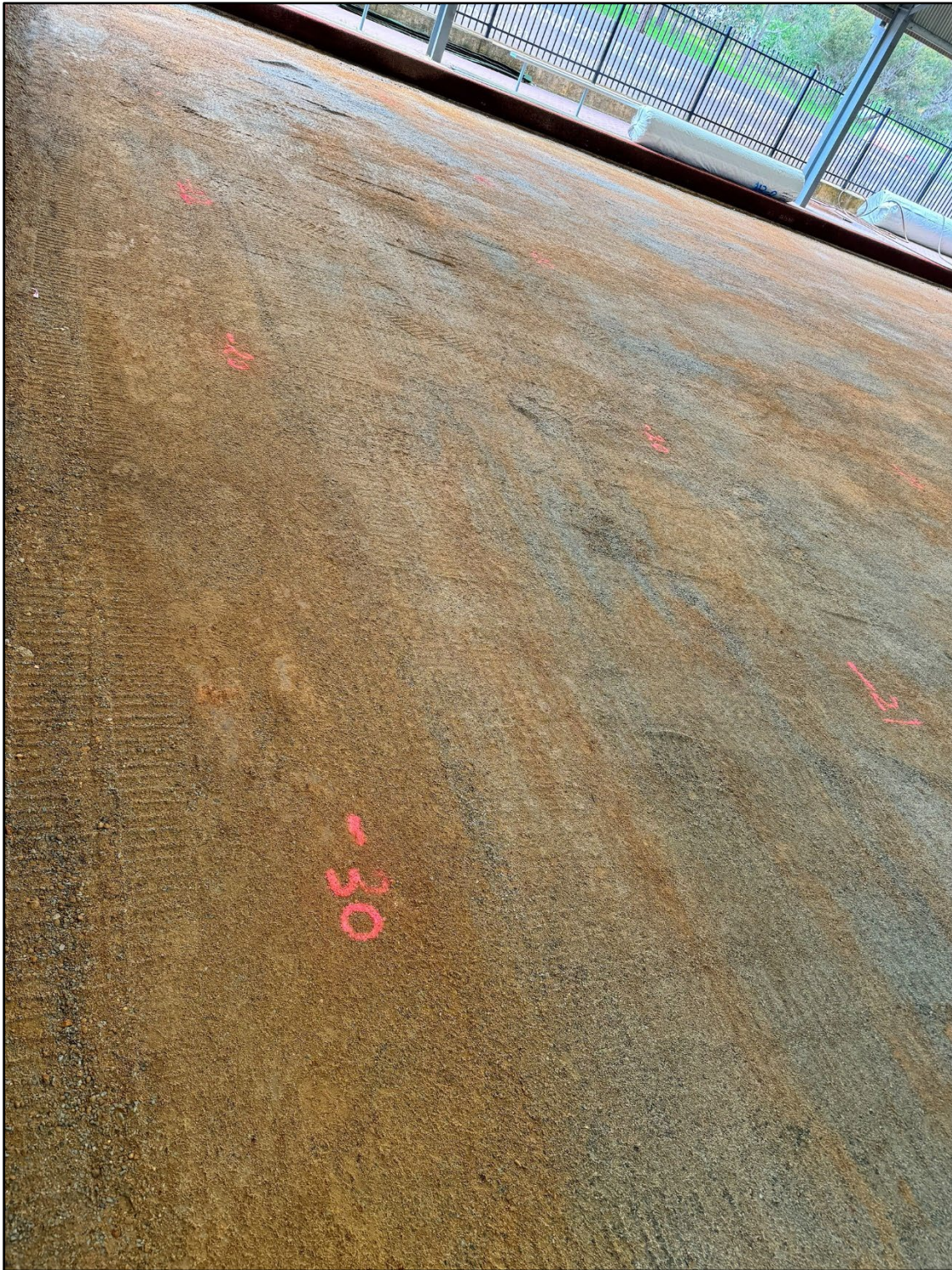
Image 4: This image highlights sub-base variations of up to 30mm in certain areas, far exceeding the accepted tolerance of \pm 4\text{mm} . These discrepancies were a major factor in the failure of the base system.