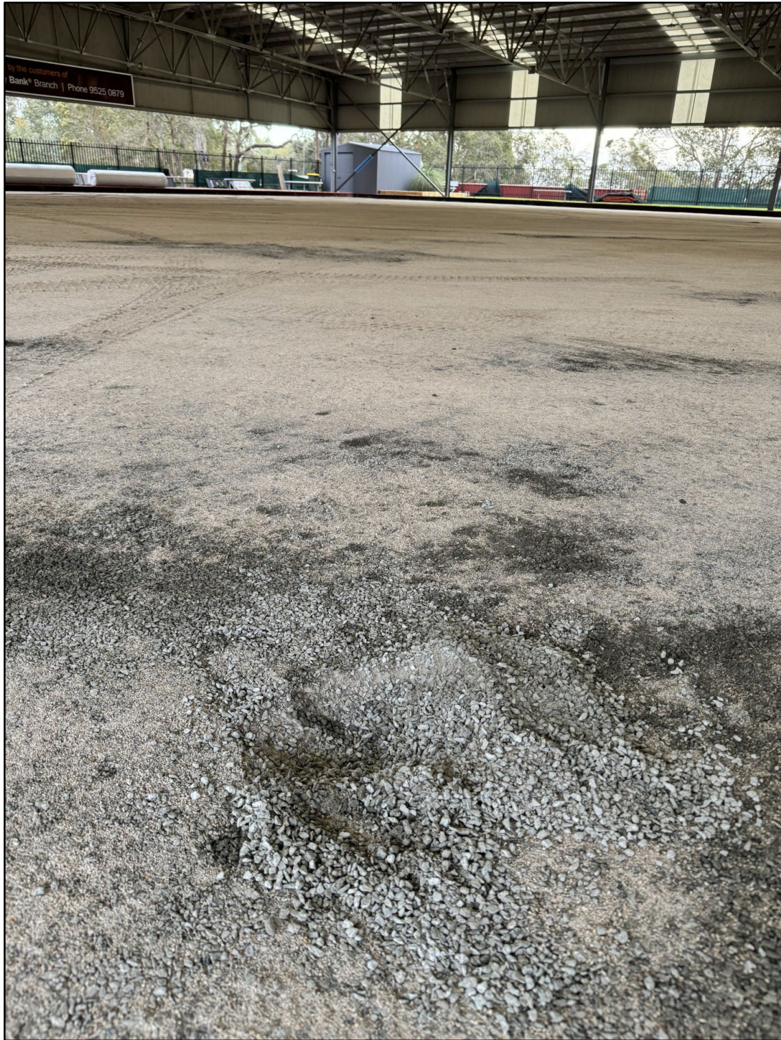
Image 2: This shows the crumbling base, which should consist of a bonded mixture of blue metal and concrete to create a solid, level playing surface.