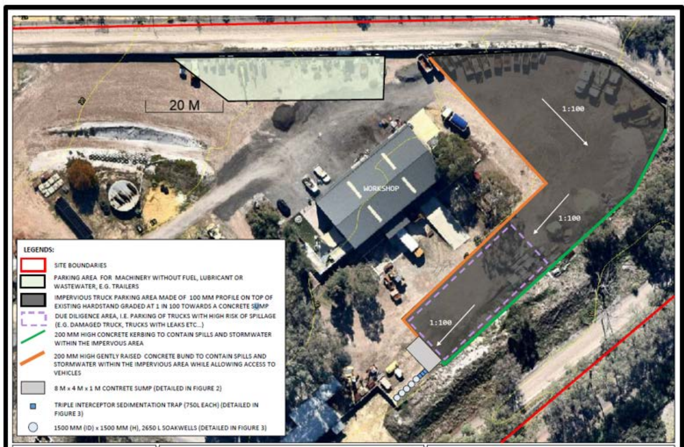
Figure 4: Proposed spill and Stormwater Management System

As shown in Figure 4 below, the parking areas will be divided in two main categories, consisting of the existing hardstand for machinery or equipment without fuel tanks, lubricant or harmful liquid, e.g. trailers; and an impervious truck parking area (including employee vehicles) made of 100 mm of compacted asphalt profile on top of the existing hardstand.