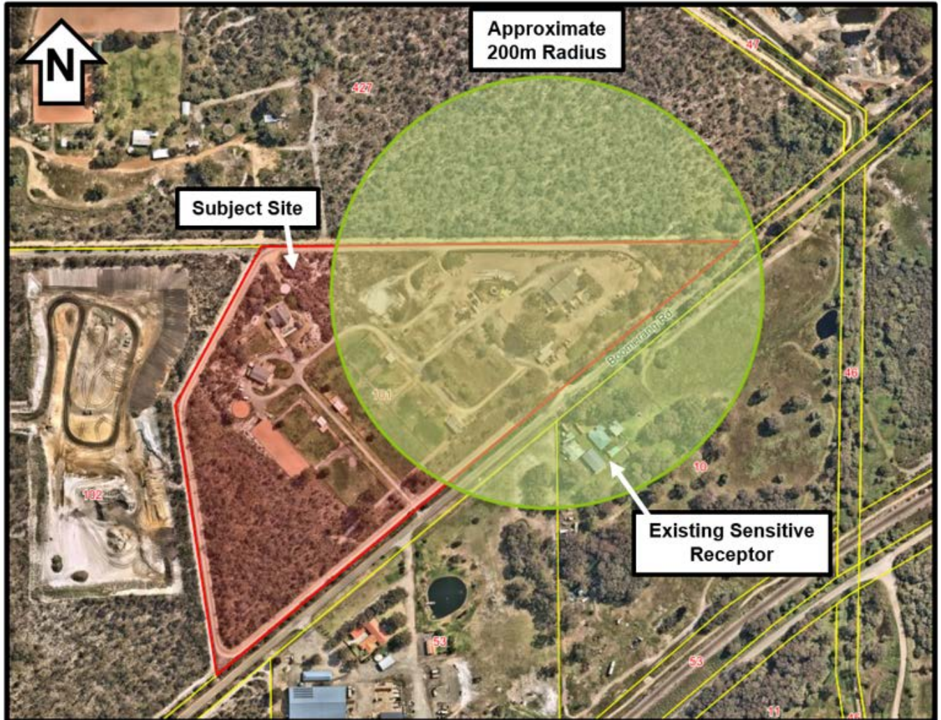
Figure 5: Separation Distance

The separation distance recommended between a 'Transport Depot' and sensitive land uses is 200m. The off-site health and amenity impacts associated with a 'Transport Depot' is primarily noise. Figure 5 below identifies that there is one sensitive receptor within the generic 200m separation distance which is a dwelling located at Lot 10, 133 Boomerang Road, approximately 70m from the development site.