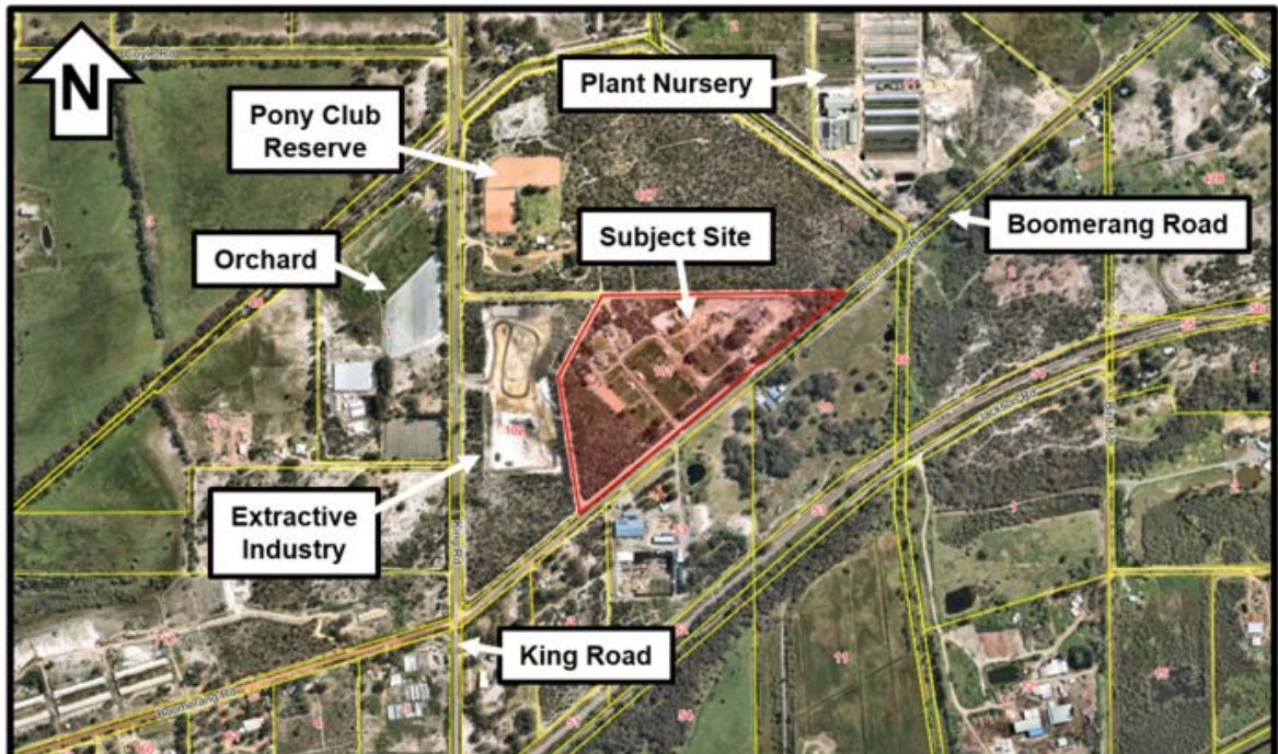
Figure 1: Location Plan

an intended rural amenity and character under the current and proposed planning frameworks for the future.