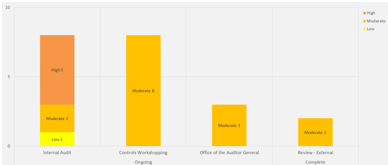
Diagram 1: Ongoing Recommendations based on report type and risk.

The following is further breakdown of ongoing recommendations within the Shire based on report type and risk: