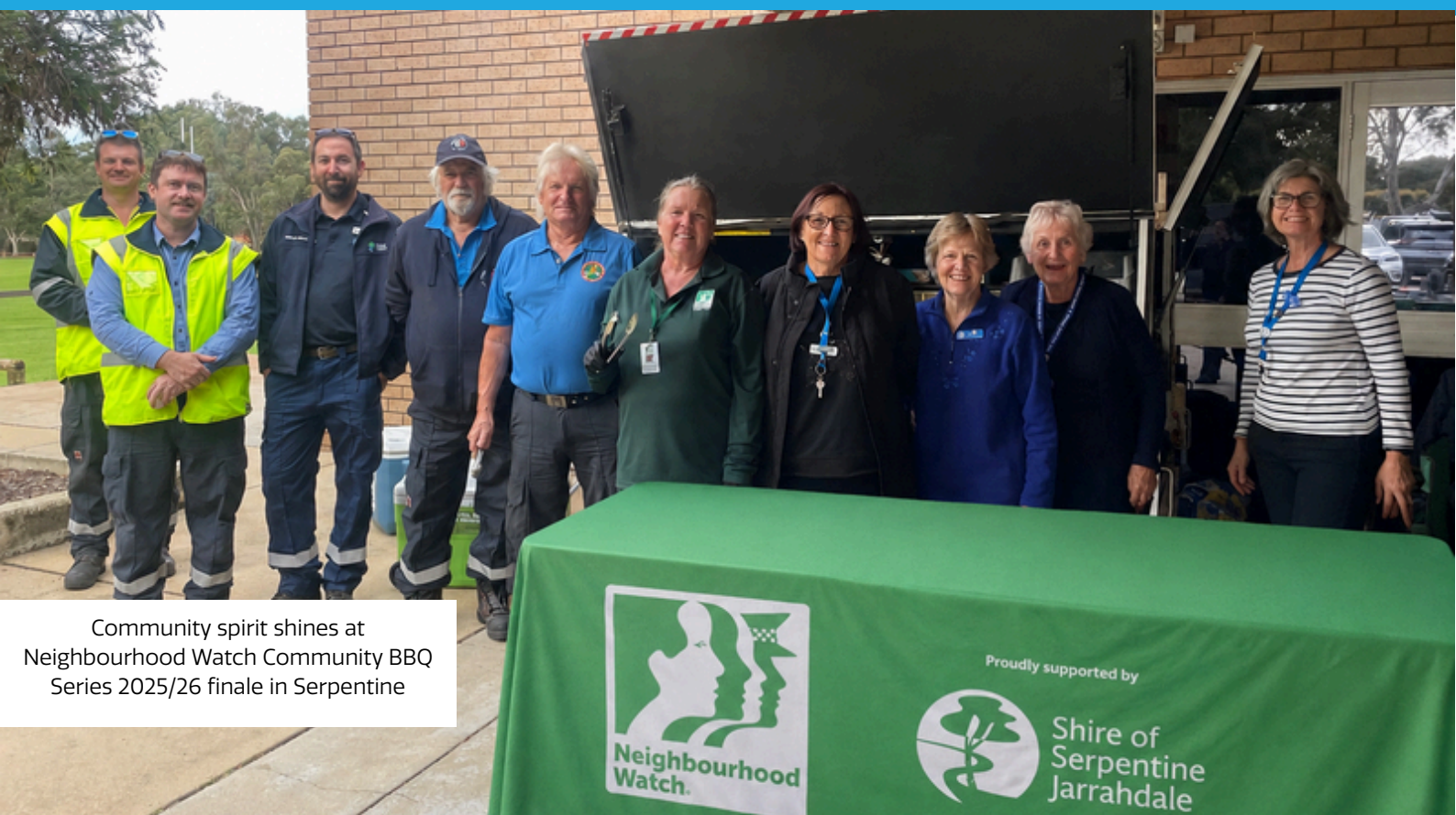
Community spirit shines at Neighbourhood Watch Community BBQ Series 2025/26 finale in Serpentine