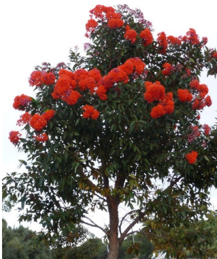
Red Flowering Gum