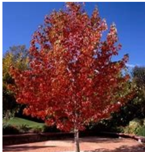
Liquidambar Sweet Gum

Wide spreading canopy, good for wide verges, to create avenues of bright red colour.