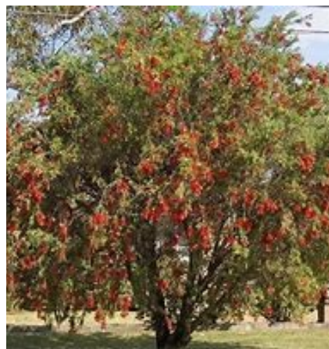
Bottlebrush Kings Park Special