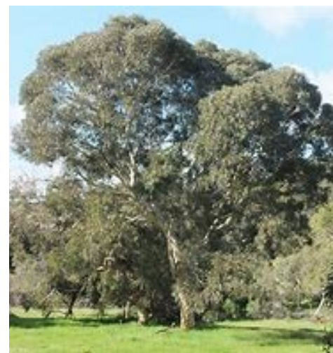
Darling Range Ghost Gum

Ideal for narrow verges to create colour and seasonal interest.